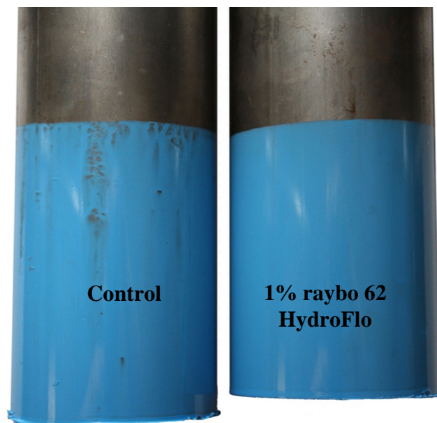
Fig 2. The use of raybo 62 HydroFlo allowed for a continuous coating, even over the oil and dirt.